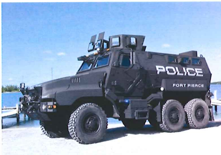
MRAP seen here in tactical black.

The School Police MRAP will be painted medium grey with "RESCUE" in large red letters where "POLICE" is located on this vehicle. The vehicle will have appropriate San Diego Unified School District and School Police markings. The above vehicle has an armored turret; our vehicle will not have a turret.